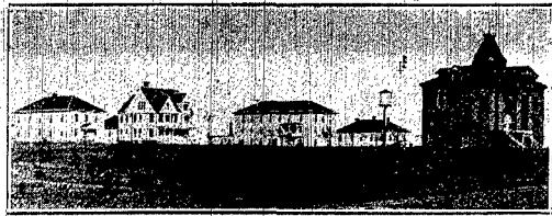
VIEW OF WAYNE COLLEGE IN 1910

Stage set for gala day Saturday on school's thirtieth anniversary.