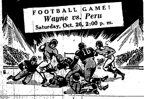
FOOTBALL GAME! Wayne vs. Peru Saturday, Oct. 26, 2:00 p. m.