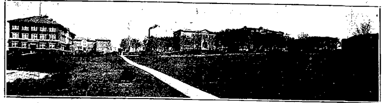
VIEW OF WAYNE COLLEGE IN 1940

Stage set for gala day Saturday on school's thirtieth anniversary.